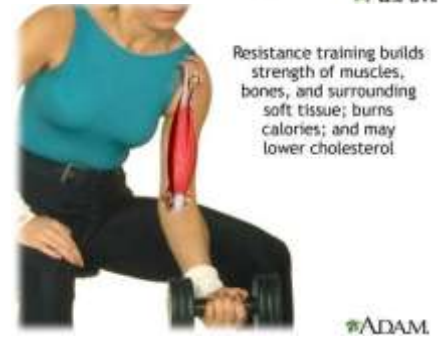
Resistance training builds strength of muscles, bones, and surrounding soft tissue; burns calories; and may lower cholesterol