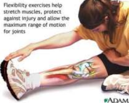
Flexibility exercises help stretch muscles, protect against injury and allow the maximum range of motion for joints