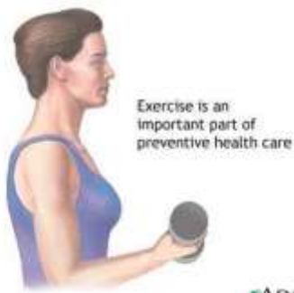
Exercise is an important part of preventive health care