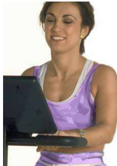
Regular exercise has a positive effect on the general health of people with diseases or chronic conditions, and can lessen the severity of emotional disorders by giving the person a sense of greater control

DECREASE ANXIETY. DECREASE DEPRESSION. REDUCE STRESS. DROP your HEART ATTACK and STROKE risk. DECREASE your BLOOD PRESSURE and CHOLESTEROL STRENGTHEN your BONES.