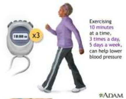
Exercising 10 minutes at a time, 3 times a day, 5 days a week, can help lower blood pressure